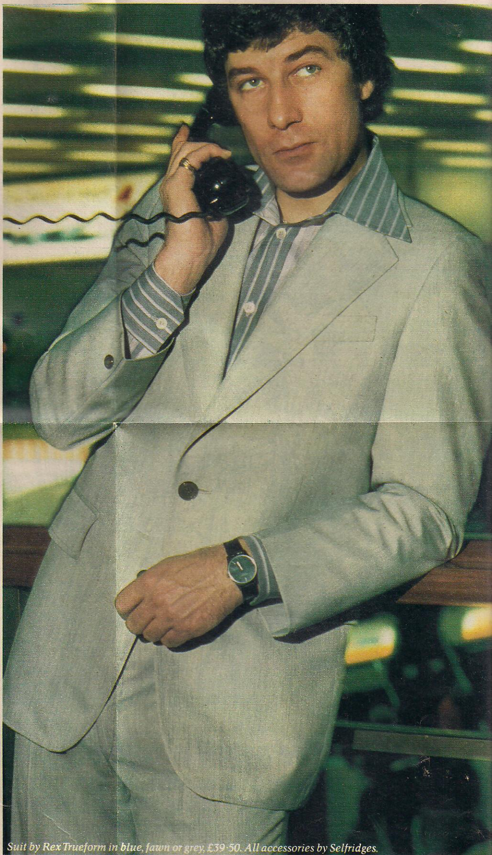
Suit by Rex Trueform in blue, fawn or grey, £39.50. All accessories by Selfridges.